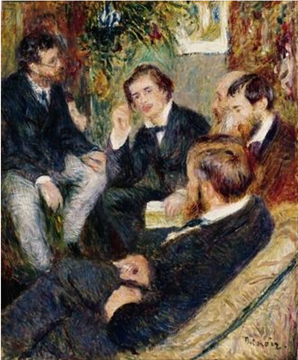
The Artist's Studio, Rue Saint-Georges (1876) Auguste Renoir